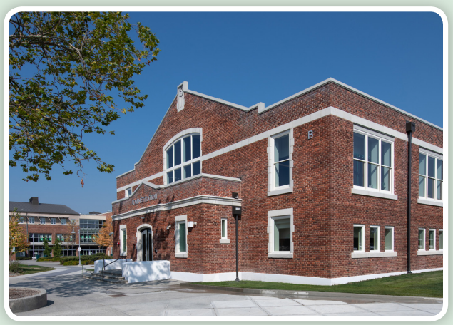
Mount Vernon High School Administration Building

Still to come as part of the voter-approved 2016 Bond is additional classroom space on the high school campus and additional classroom space at LaVenture Middle School.