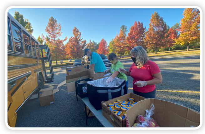
Nutritional Services Staff provide meals to families during extended services.

Scan to access our Meal Services Schedules.